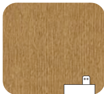
Allgold Bamboo + Coordinating color grid