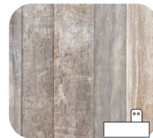
Driftwood Planks + Coordinating color grid