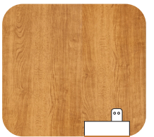
Medium Cherry + Coordinating color grid