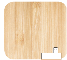
Light Bamboo + Coordinating color grid