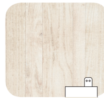
Whitewashed Planks + Coordinating color grid